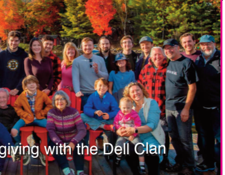
Thanksgiving with the Dell Clan