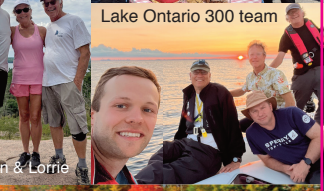
Lake Ontario 300 team