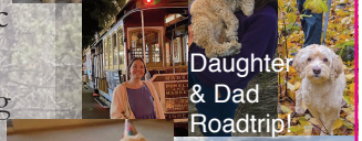
Daughter & Dad Roadtrip!