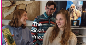
The Pickle Prize