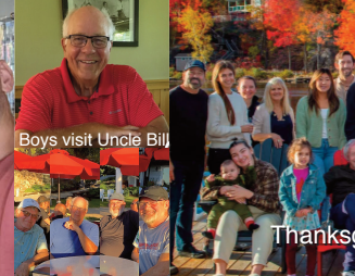
Boys visit Uncle Bill