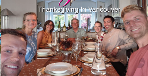
Thanksgiving in Vancouver