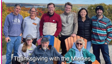
Thanksgiving with the Miskles