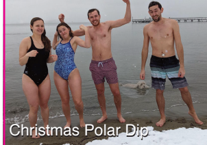
Christmas Polar Dip